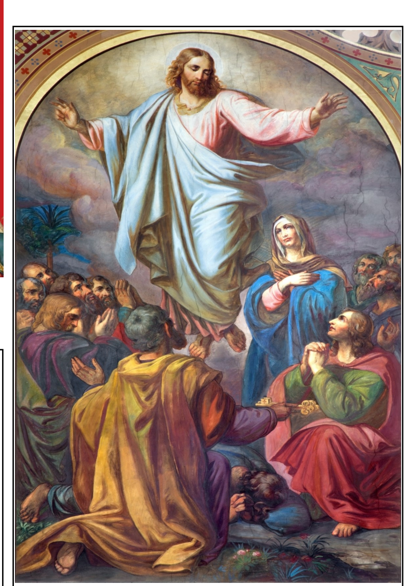
"Holy Father, keep them in your name that you have given me, so that they may be one just as we are one. Consecrate them in your truth. Your Word is truth. As you sent me into the world, I have sent them into the world."